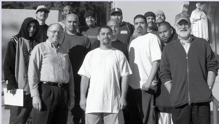
Homeboys Retreat 2007

Our Annex guests will enjoy new carpets throughout and new lighting in halls and bathrooms. The most welcome addition may be new ceiling fans in the rooms of St. Joseph's and the Annex, which will help our summer guests beat the heat.