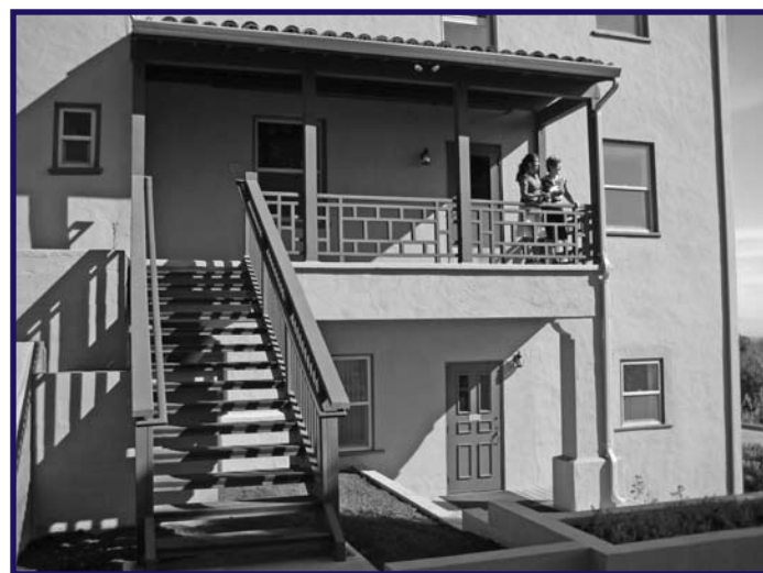
Leelamma Sebastian and Carmel Smith enjoy the view from the newly renovated south porch of Loyola Hall.

Our crew took advantage of the opportunity to add some new retaining walls and to replace others built to a previous standard. The crew also installed irrigation in the garden areas below and around the porch and are adding new plantings.