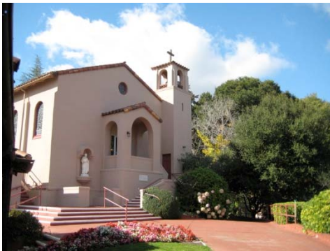
The Rossi Chapel built in 1928