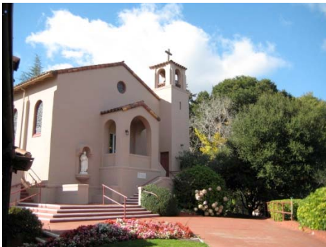
The Rossi Chapel built in 1928